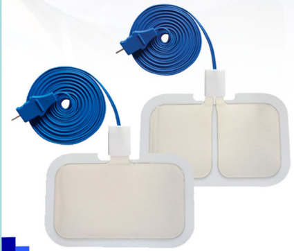
HT-PA1T-WV and HT-PA2T-WV