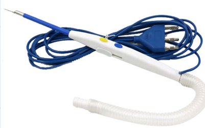
HT-9 ESU Pencil