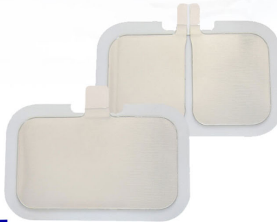
HT-PA1T and HT-PA2T