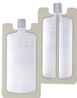
HT-PA1 and HT-PA2