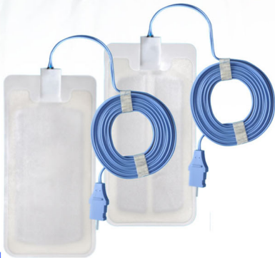
HT-PA1-WV and HT-PA2-WV